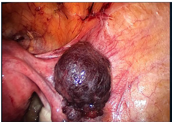
Figure 3: Intra-operative picture of right adnexal mass.