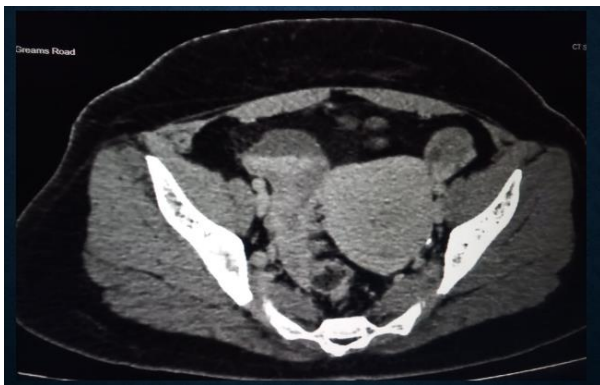
Figure 2: CECT Abdomen showing right adnexal mass.