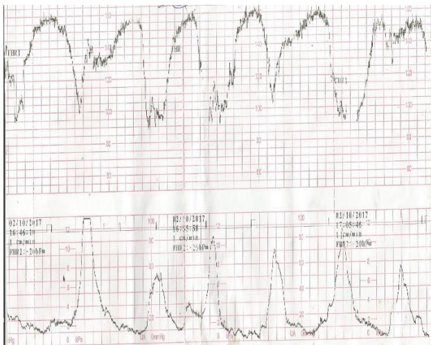
Figure 2: Decelerations on fetal monitoring.

Moreover, there was normalization of cardiocograph after repositioning of the patient and any abnormalities was observed during 6 hours.