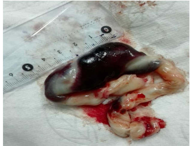
Figure 3: Aspect of umbilical cord hematoma in 5.5 cm immediately after birth.

At cervical dilation at 5 cm and vertex engaged, there were a number of decelerations on fetal monitoring (Figure 2). Cesarean section was indicated for acute fetal distress. But vaginal birth with suction cup obstetrical was performed in cesarean room few minutes after this indication. This is because that the patient had an imperious need to push and complete the dilation before incision. A still born female fetus weighing 2660g with no visible external anomalies was delivered. In the investigation of this still birth, examination of the placenta and cord has been emphasized. Placenta was in healthy appearances, with central cord insertion. The placenta weighed 580g and cord measured 52cm. The umbilical cord was in aubergine color in 5.5 cm (Figure 3). A fetal autopsy and histology exams were advised but not performed as family refused.