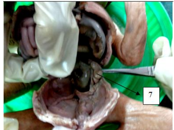
Figure 4: Laparotomy: 7) Lobulated kidney on left side.