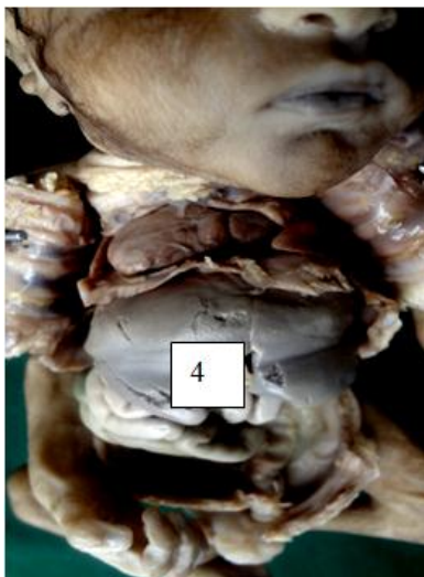
Figure 2: Laparotomy: 4) Liver.

There was agenesis of right kidney, ureter and both the suprarenal glands, left kidney was lobulated with normal ureter, uterus, fallopian tube and both ovaries were in normal anatomical position. Figure 2, 3, and 4 show above features.