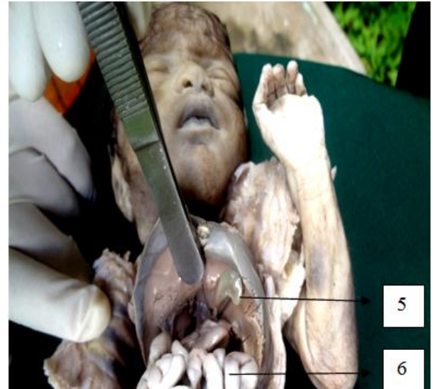
Figure 3: Laparotomy: 5) Gall bladder 6) Coils of intestine.