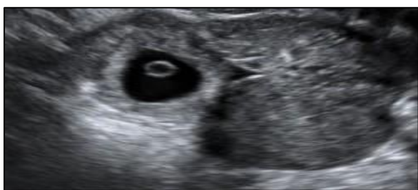
Figure 1: USG image showing the foetus inside the right fallopian tube.

A 35 year old nulligravid woman presented to our fertility centre (Institute of kidney diseases and research, Ahmedabad) for evaluation of primary infertility. She was married for 16 years and led an active married life. The patient had undergone ovulation induction (OI) with clomiphene citrate and intrauterine insemination (IUI) several times previously.