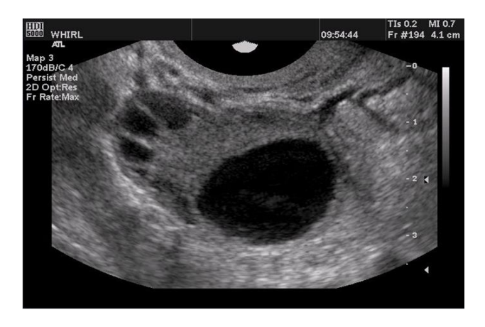
Figure 2: A dominant follicle just about to rupture.

In this study maximum number of cases 103 (68.67%) had infertility of 4-6 years duration and rest 47 (31.33%) were in 1-3 years of duration (Table 3). Out of 150 cases, all patients are divided in two groups, spontaneous cycles (50) and induced cycles (100). Out of 50 patients of spontaneous cycles, majority of patients were found in 21-22 mm size i.e., 23 (46%) followed by 18-20 mm size i.e., 14 (28%) and minimum patients were found in >24 mm size group i.e., 6 (12%). While in induced cycles, majority of patients were found in 23-24 mm size i.e., 48 (48%) followed by 21-22 mm size i.e., 22 (22%) and minimum patients were found in 18-20 mm group i.e., 14 (14%) (Table 4), (Figure 2).