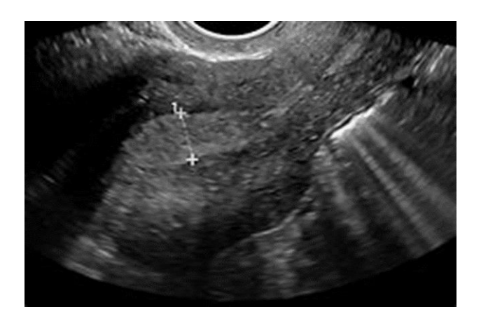
Figure 3: How to measure endometrial thickness.

In this study maximum number of cases 103 (68.67%) had infertility of 4-6 years duration and rest 47 (31.33%) were in 1-3 years of duration (Table 3). Out of 150 cases, all patients are divided in two groups, spontaneous cycles (50) and induced cycles (100). Out of 50 patients of spontaneous cycles, majority of patients were found in 21-22 mm size i.e., 23 (46%) followed by 18-20 mm size i.e., 14 (28%) and minimum patients were found in >24 mm size group i.e., 6 (12%). While in induced cycles, majority of patients were found in 23-24 mm size i.e., 48 (48%) followed by 21-22 mm size i.e., 22 (22%) and minimum patients were found in 18-20 mm group i.e., 14 (14%) (Table 4), (Figure 2).