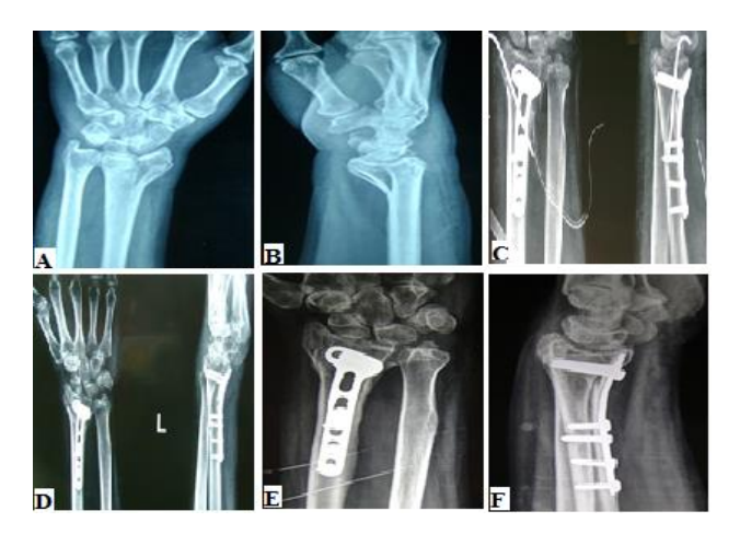
Figure 1: X-ray photographs of case 1.

40 years male patient, a laborer with history of fall down had distal end radius fracture. He was operated by Volar locking plating with a k wire through styloid process. K wire was removed after 4 weeks and mobilization was started. Score is excellent.