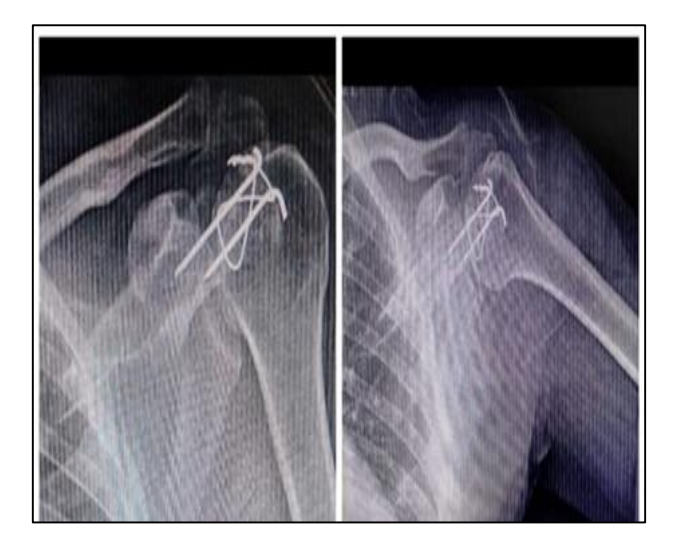
Figure 3: Immediate post op X-ray showing adequate reduction of acromion fracture after TBW.