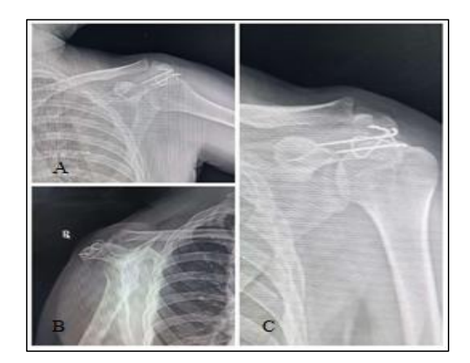
Figure 4 (A-C): Axillary, scapular Y view and antero posterior view of left shoulder respectively at 18 months follow up.