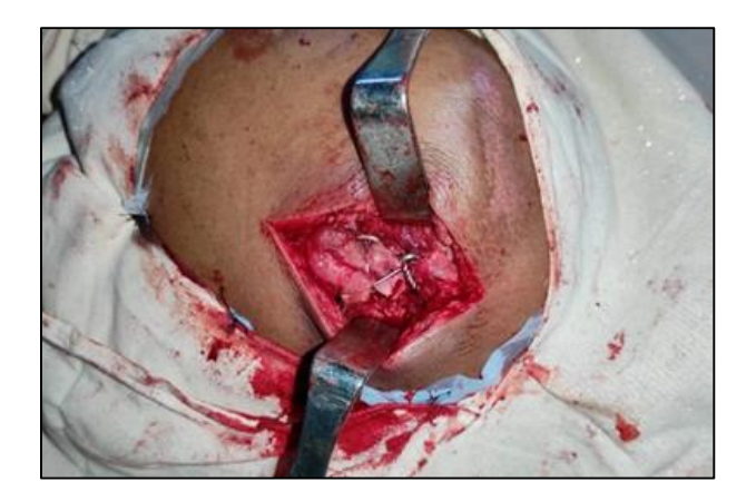
Figure 2: Intra operative image showing TBW of acromion process.