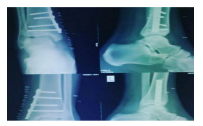
Figure 2: Immediate postoperative X-ray after osteosynthesis.