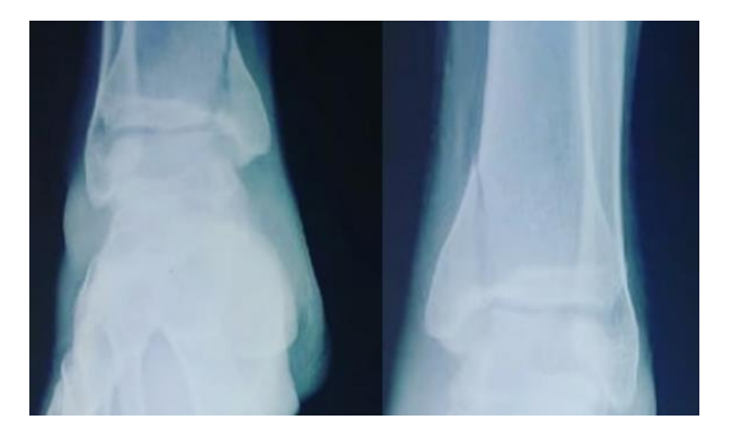
Figure 1: Pre-operative X-ray demonstrating bilateral MMSF.

patient underwent surgical management of both MMSF in the same surgical setting. Under spinal anaesthesia block, patient underwent open reduction and buttress plating using stainless steel one-third tubular plates on both limbs (Figure 2). Post-operatively, the patient was encouraged to perform active ankle range of movements immediately, protected weight bearing was started after four weeks, full weight bearing started after six weeks, although he was excused from strenuous physical activities like running and jumping for six months. On one year follow-up, the patient had full clinical and radiological union of his fractures and was performing all is training activities without any symptoms (Figure 3).