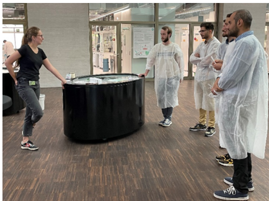
Figure 1: A group of visitors at the Discovery presentation spot, discussing subtle differences in a perfume due to a newly developed fragrance ingredient