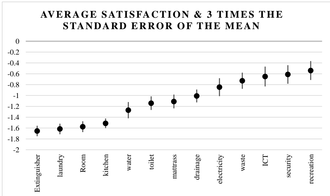
Figure 1. Average satisfacion with & 3 times the stanadrd error of the mean

The study investigates the relative and actual experiences of the students on the facilities and services provided in the hostels within the university, and Table 4 presents their assessment. The finding reveals general contentment with most of the services and facilities. For example, security-wise, electricity supply, ICT/Library, and waste management were rated in decending order of their weighted satisfactory index score. This means that the students have actual acceptance for these facilities but do not necessarily meet their expectations, as availability does not mean accessibility. Furthermore, the finding shows that respondents were not happy with the status of the drainage system, recreational grounds, toilet, room size, mattress/foam, water supply, kitchen, and fire extinguisher.