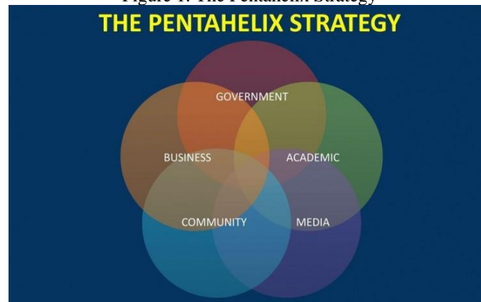
Figure 1. The Pentahelix Strategy

Of course, the development model must be realized synergistically All parties, both government, related OPD, Society, private sector, university. To enable this, Supported development program Based on community data collection, Evaluation, project work, exploitation For maintenance(Sudiana et al., 2020a). Through the development of a willingness to participate and develop the community more effectively and efficiently as people do more responsibility for sustainable development, they believe that they have the results of village development. Supporting the implementation of the potential development of the villages above(van Corven et al., 2021). This can be done in various ways, including: