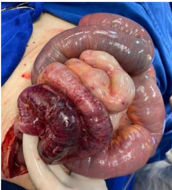
Figure 3. Cavity inventory – the presence of multiple adhesions forming a block near the terminal ileum loop with signs of ischemia, as well as a thickened area in the mesentery.

It was decided to perform a partial colectomy on the right with resection of the ischemic segment, undoing the adhesions found and making a Mikulicz ileostomy, which the patient remains in use until now at his own choice and that of the surgical team, due to its adaptation.