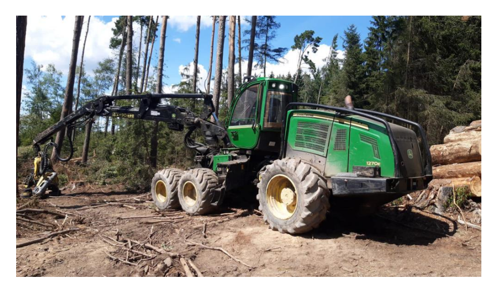
Figure 1. Machine 1270E.

The subject of research was a large wheeled harvester 1270E (Figure 1) made by Deere & Company, which is known under the trademark of John Deere. The machine is equipped with the hydraulic, parallel, automatically levelling boom of 11.7 m in reach, located on the front part of the articulated machine frame. This part of the frame is also attached to a swivel cab with the suspended pneumatic seat. The cab is able to balance its tilt in all directions up to 17^{\circ} , which is less than the maximum possible angle of boom levelling, which is possible only forward and backward within a range from -15^{\circ} to +28^{\circ} . On the rear part of the frame, there is a combustion engine with an output of 170 kW at 1900 rpm, which receives fuel from the fuel tank of 435 L in volume, situated next to the engine. The front part of the harvester frame is fitted with bogie axles with 710/45 R26.5 tyres. A fixed axle with 710/55 R34 tyres is mounted onto the rear harvester frame part. The machine was further equipped with the harvester head H414 from the same manufacturer, the weight of which was 1 100 kg. The total weight of the machine with the equipment was 18,400 kg. Machine parameters are presented in Table 1.