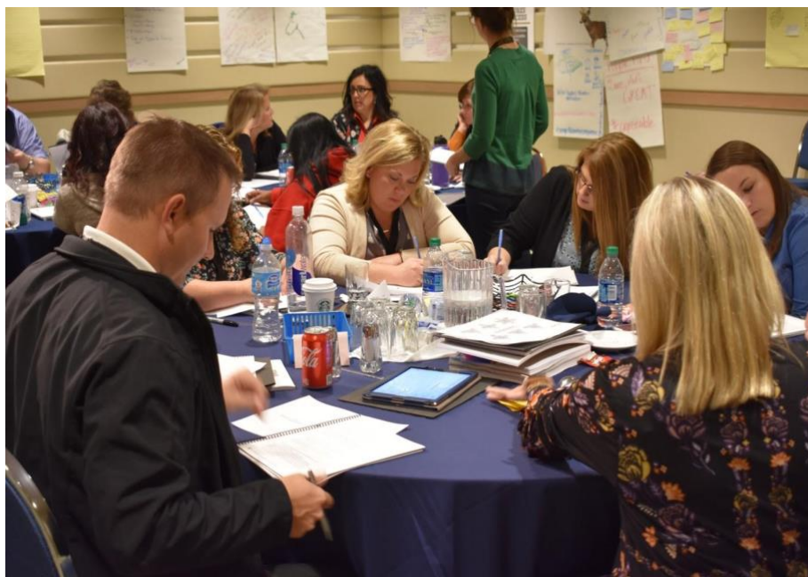
Figure 1. Stakeholders from the Idaho district reviewing data about their district and community