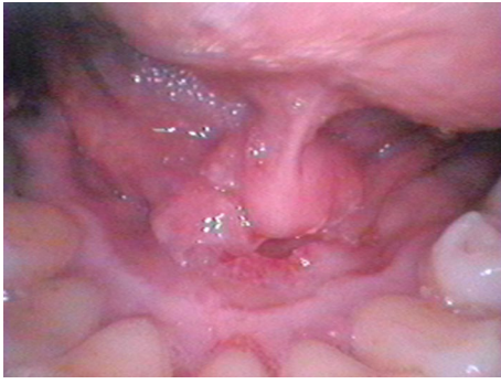
FIGURE 1 The image of the oral floor tumor. The patient presented with a 15 × 10 mm rough mass with an ulcer, erythema, and induration on the left oral floor

II), and a free forearm flap transplantation were carried out in December 2014. The margins of the excised tumor were tumor-free. The final clinical staging was pT1N2bM0, and there was more lymph metastasis than the previous CT revealed. Therefore, prophylactic postoperative chemoradiotherapy was chosen as a course of treatment (radiotherapy: 59.5 Gy/30 Fr and chemotherapy: Cisplatin [80 mg/m 2 ] + 5-FU [800 mg/m 2 ] × 2 times).