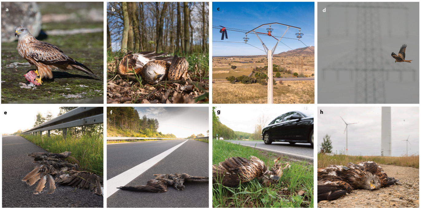
Fig. 2. Anthropogenic sources of mortality for red kites: (a) and (g) consumption of poisoned baits; (b) collisions with power lines; (f) electrocution at electric pylons; (c), (d), and (h) collisions with vehicles; (e) collisions with wind turbines.

human-mediated food, including livestock carcasses and other waste, could induce declines in reproduction during the breeding season and elevated mortality during the non-breeding season (Blanco, 2014; Blanco et al., 2017; Fulco et al., 2015; Pitarch et al., 2017). Disturbances around nests and habitat destruction might cause severe impact in local populations through reduced reproduction or reduction in the number of breeding territories (Carter, 2007; Davis and Davis, 1981; Seoane et al., 2003; Viñuela et al., 1999), which may be partly attributed to high breeding fidelity (e.g., using the same territory for up to 18 consecutive years; Ortlieb, 1989).