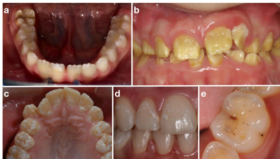
Figure 1. Clinical images showed in the questionnaire: (a), molar incisor hypomineralization; (b), amelogenesis imperfecta; (c), dental fluorosis; (d), white spot lesion; (e), caries lesion.

The anonymous questionnaire consisted of 28 closed-ended questions in the form of dichotomous, multiple-choice or Likert scales (Supplementary Table S1). The items investigated the basic knowledge acquired about DDE and the ability to distinguish among different developmental defects of enamel through the presentation of five clinical images (Figure 1).