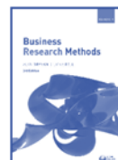
978-0-19-958340-9 March 2011 | £42.99