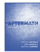
978-0-19-965841-1 July 2012 | £20.00

www.oxfordtextbooks.co.uk www.oup.com/uk