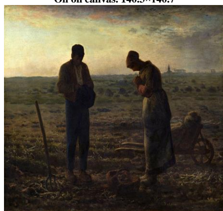
Fig. 3. Jean-François Millet. The Angelus, 1857–1859. Oil on canvas. 55.5× 66