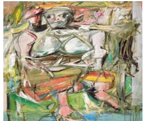
Fig. 5. Willem de Kooning. Woman No. 1, 1950–1952. Oil on canvas and metallic paint. 192.7×147.3