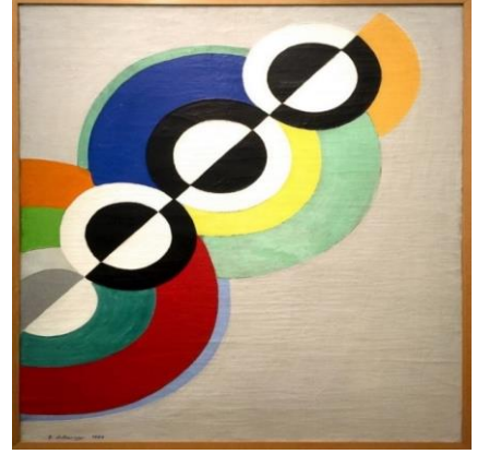
Fig. 4. Robert Delaunay. Rythme, 1934. Oil on canvas. 145×113