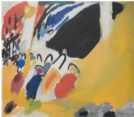
Fig. 6. Wassily Kandinsky. Impression III, 1911. Oil on canvas. 78.5×100.5