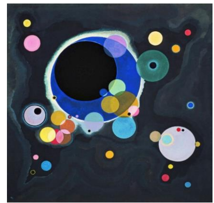
Fig. 1. Wassily Kandinsky. Several Circles, 1926. Oil on canvas. 140.3×140.7

to beautiful and moving music, sometimes a vivid scene of «kites flying in the sky and fish leaping into the abyss» appears before our eyes, and when we watch vivid paintings, we feel «lonely and silent, but our ears are always full of listening», which is exactly what the artistic feeling of communication shows beyond the physical This is the aesthetic effect of art beyond the physical.