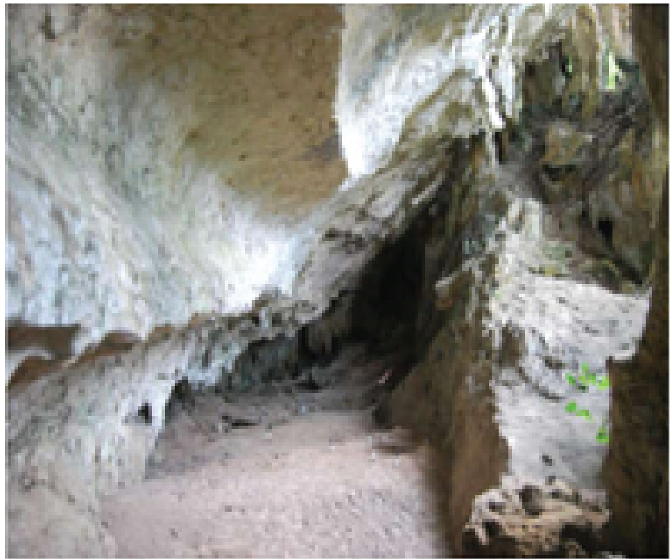
Figure 1: Liang Ulin Cave Floor 2 Terrace 2a.