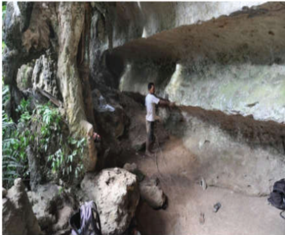
Figure 2: Liang Ulin Cave Wall 2 Terrace 3.

using massage techniques (to attach the base and ears to the body), slow turning wheel and face peladas (to make the body and edges)[3].