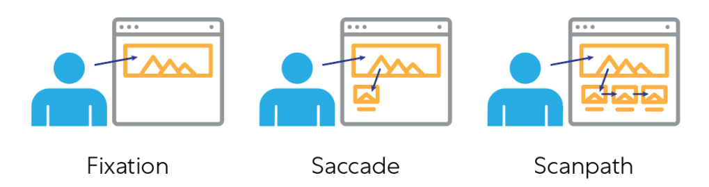
Figure 3: Eye Tracking Tactic.

3. Scanpaths are accumulations of a series of fixations and saccades.