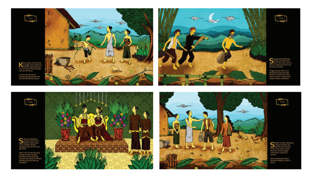
Figure 6: Tester: combine image and verbal.

Then Figure 6 is a combination of illustrated images with verbal/written descriptions. Arrange images in a layout that combines images and text on different sides.