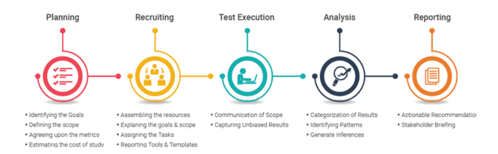
Figure 1: User Testing Method [10].

This method combines Visual Narrative with typography. This trial aims to cover the weaknesses of visual Narrative with the addition of typography, and vice versa, to cover the weaknesses of delivering messages with typography or verbally, with the strengths of Visual Narrative. The process flow of the User Testing method can be seen in Figure 1 below: