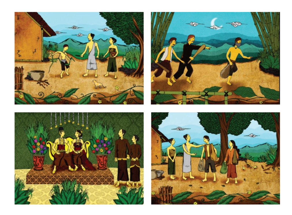
Figure 4: Tester: image only.

named Ki Kures and Nyi Kures. Ki Kures and Nyi Kures have a son named Bambang Durjana.)