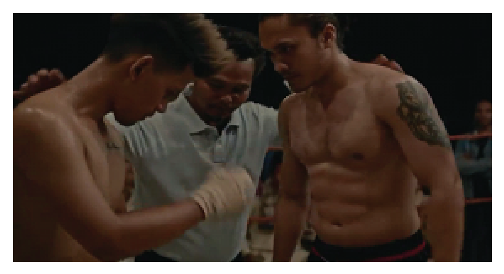
Figure 1: The Boxer's body as the representation of hegemonic masculinity.

and femininity. Therefore, the existence of this group is stigmatized and effeminate by masculinity.