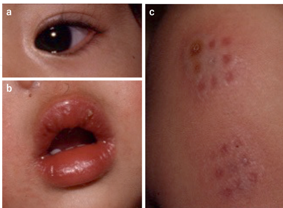
Figure 1. Typical clinical symptoms of Kawasaki disease. (a) Bulbar conjunctival injection, (b) Reddening of lips, (c) Redness at the site of Bacille Calmette-Guerin inoculation.