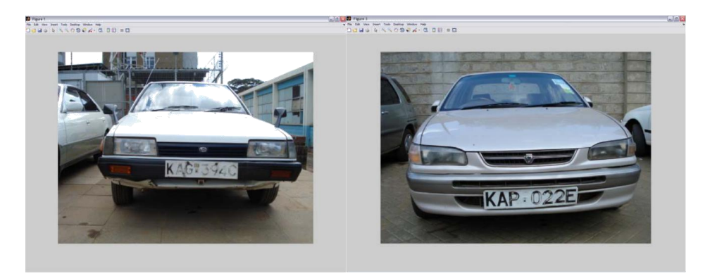
Fig. 7. Images of vehicles with faded plates