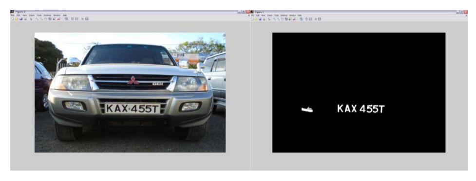
Fig. 1. Input image and the resulting extracted plate characters

Fig. 1 shows input image (left) and the resulting extracted license plate characters. The horizontal noise objects violate orientation requirements, and are thus not considered.