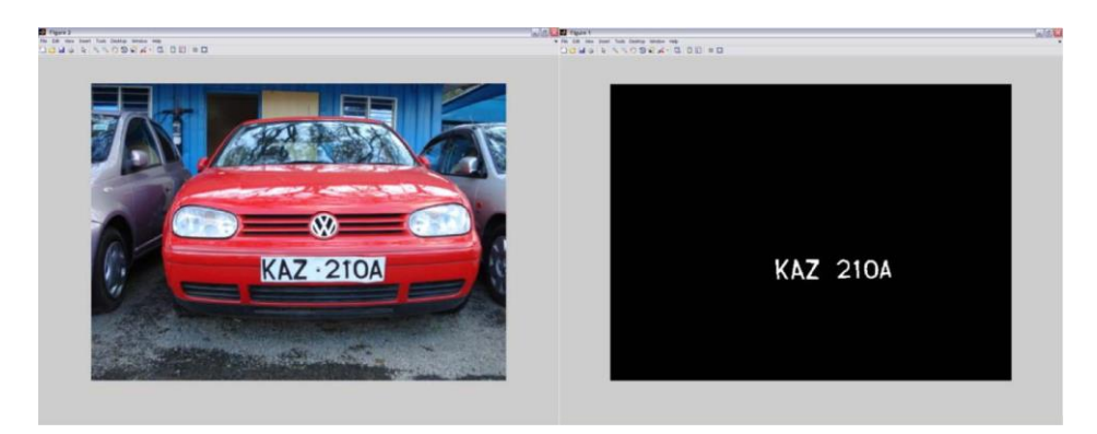
Fig. 2. Input image having large texture regions

Fig. 3 represents the limiting case, showing car on coarse stone background. In this case the texture mask is overwhelmed by the numerous and large changes in local pixel intensities.