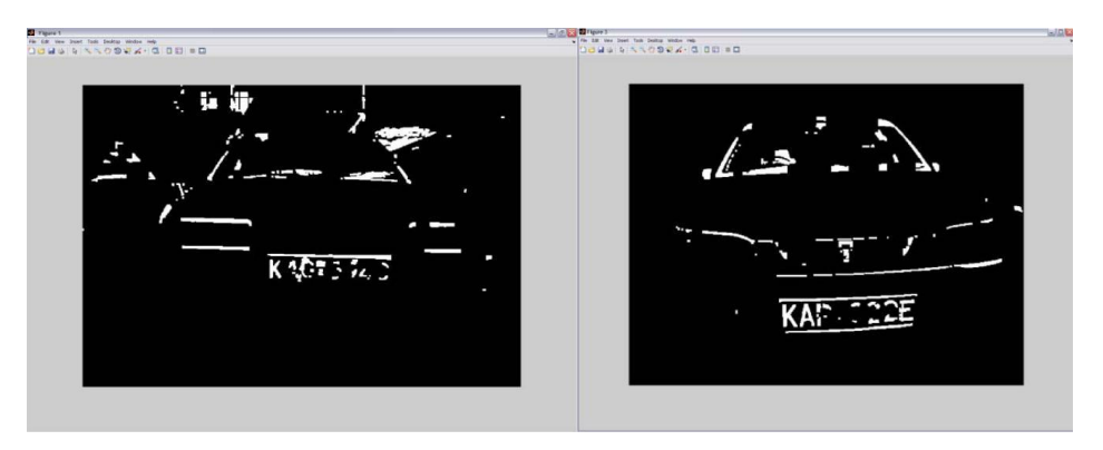
Fig. 8. Extracted license plate characters are too fragmented

Fig. 9 shows input image (left) is too close to the camera. The fixed size of the structuring element used in the top hat filter results in fragmented characters.