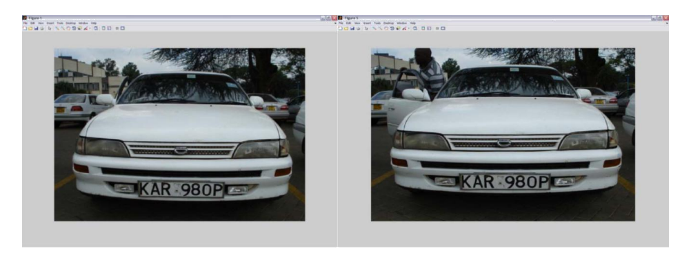
Fig. 4. Images show same vehicle in subsequent frames