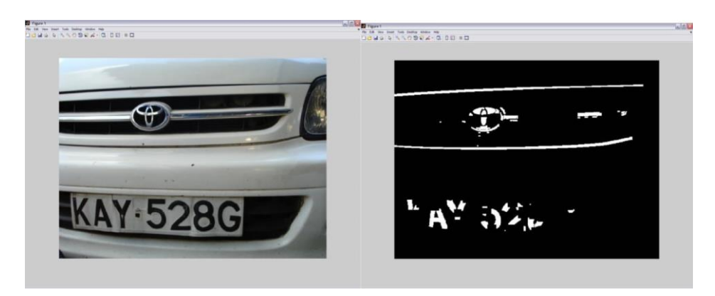
Fig. 9. Input image is too close to the camera

Fig. 9 shows input image (left) is too close to the camera. The fixed size of the structuring element used in the top hat filter results in fragmented characters.