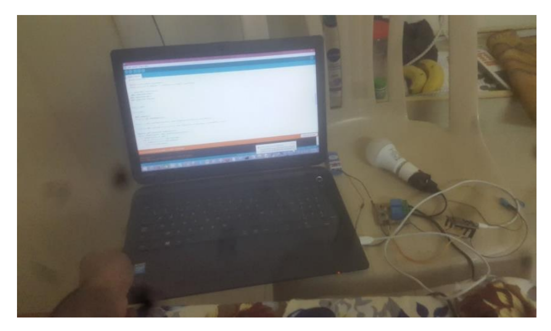
Figure 2: The developed experimental setup as shown.

After knowing the total individual consumption and total power consumption, the IFTTT Android application can control their appliances at any time.