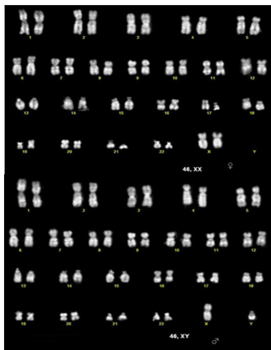
Figure 1: Karyotype of the patient showing the co-existence of both 46XX/XY cell lines in the same cell

The Karyotyping test showed the co-existence of both 46XX/XY cell lines in the same cell (Figure 1).