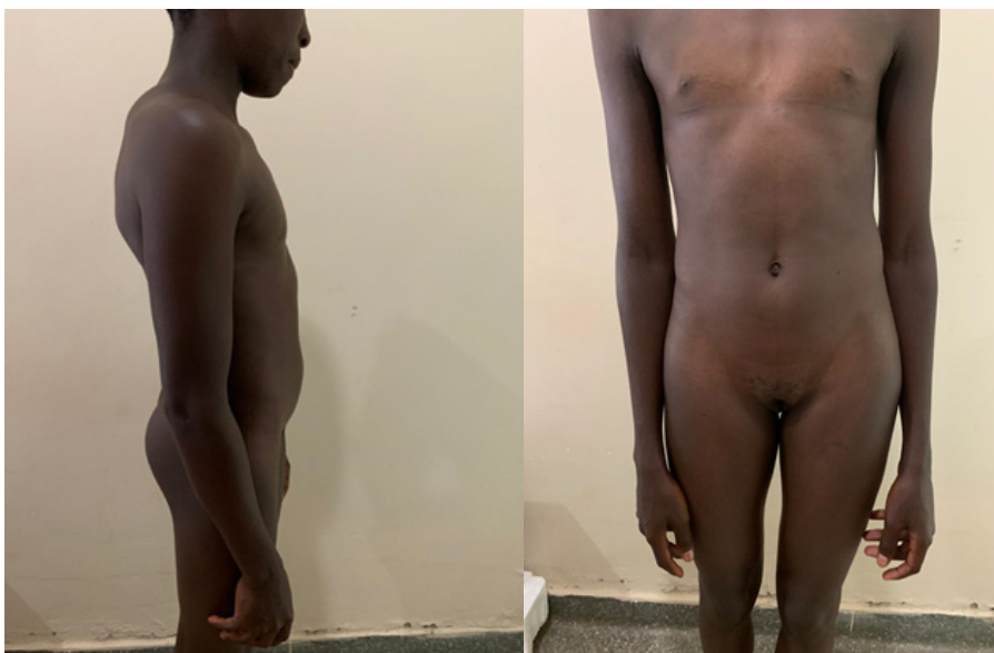
Figure 2: Male physical characteristics of the patient despite having female external genitalia

We did genetic counselling to provide information related to genotypic sex of the patient. Counselling also aimed at managing emotional distress of the patients and their caretakers as well as to give the information regarding available treatment. After genetic counselling, the patient was referred to endocrinologist for stimulating female sex hormones with respect to the phenotypic sex appearance to help develop female secondary sexual characteristics. The patient is reviewed once in a year for evaluation of the hormonal treatment prescribed.