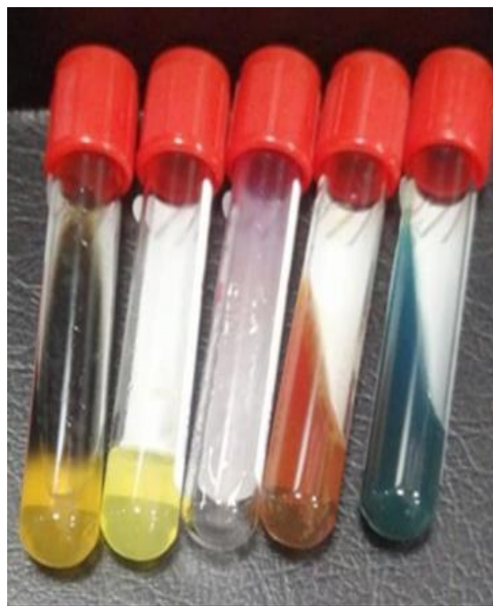
Figure 1. Results of biochemical reactions: 1: triple sugar iron (TSI), 2: urease, 3: motility indole ornithine medium (MIO), 4 : lysine iron agar (LIA) & 5: Citrate.

a MIC: Minimum inhibitory concentration, b S: sensitive; I: intermediate; R: resistant; c WGS: whole genome sequencing.