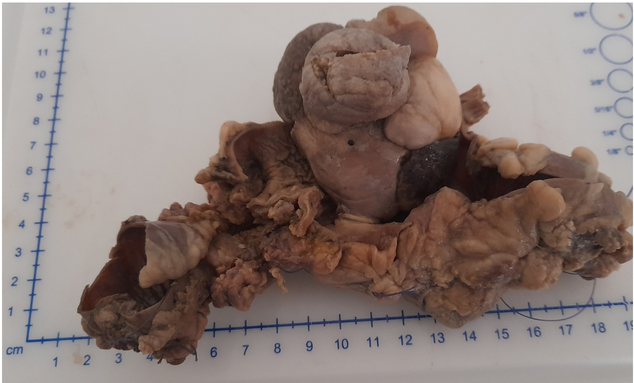
Figure 1: Formalin-fixed sigmoid colon resection segment showing an intraluminal polypoid teratoma

Macroscopic analysis of the resected intestine showed a segment measuring 17cm in length. On opening, there was a lobulated pedunculated polypoid mass protruding into the lumen. The mass measured 7 x 6 x 5 cm and its cut surface was entirely solid. The stalk was slender, measured 0.6cm in diameter and traversed the tunics of the colon to the exterior (Figure 1).