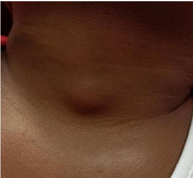
Figure 1: clinical presentation of the nodule