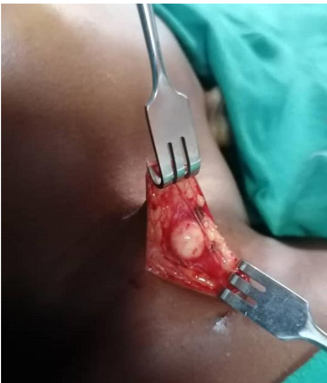
Figure 2: intraoperative view of the nodule after neck excision