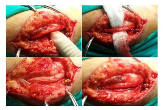
Figure 3 : at operation, the right ulnar nerve was compressed by the adhessive bant and muscle