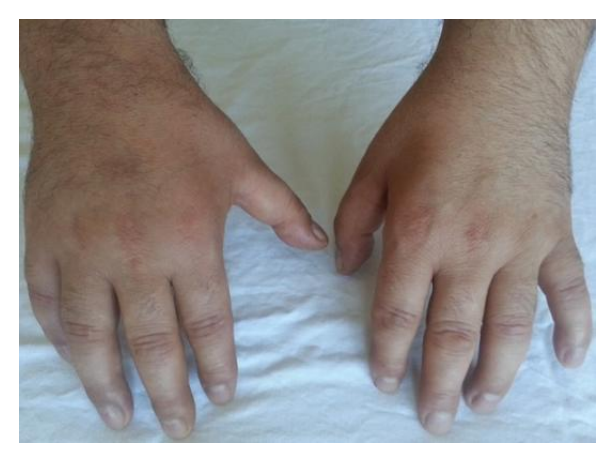
Figure 1: before the operation, patient's hands