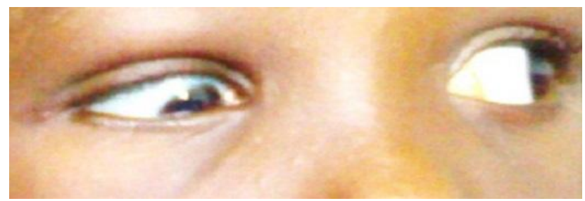
Figure 4 : a down shoot of the right eye with limitation of adduction and narrowing of the palpebral fissure