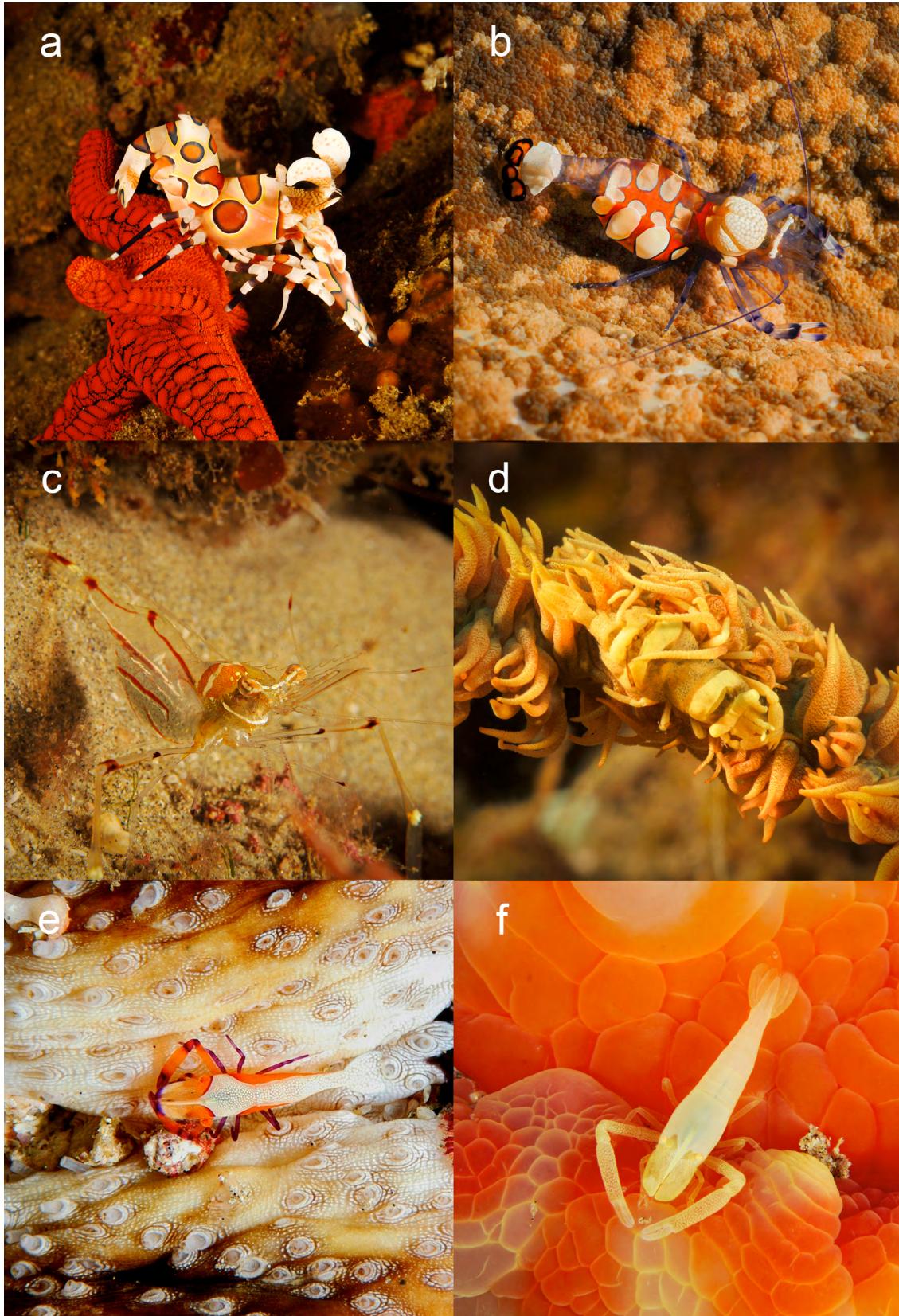
Figure 1. a. Hymenocera picta Dana, 1852 Aliwal Shoal off Scottburgh; b. Ancylocaris brevicarpalis Schenkel, 1902, Sodwana Bay; c. Cuapetes tenuipes (Borradaile, 1898) and d. Pontonides unciger Calman, 1939), both Sodwana Bay, Bikini Reef; e. Zenopontonia rex (Kemp, 1922) and f. colour variant of Z. rex , both Sodwana Bay; photographs all Valda Fraser.