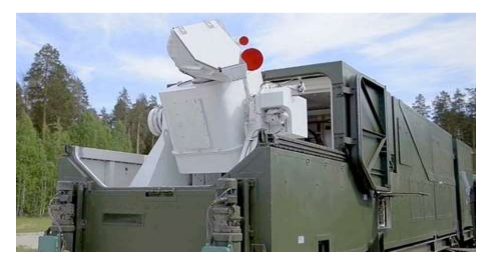
Figure 11: Russian Peresvet anti-satellite laser weapon system.

Russia is considered the foremost space adversary of the USA since from the Cold Warera it has a lot of operational space hardware till today. The initial militarisation of space in history was by placing a cannon, the Salyut-3 space station by the USSR. The USA is concerned with Russia's military counter-space program to deny or neutralize US space-based military and commercial satellites (Mizokami, 2019b). Russia is also making efforts to develop GPS jamming technology to be able to interfere with adversaries' space assets on the ground without space. necessarily going into The new technology could also jam and interfere with satellites and their ability to convey messages between terrestrial forces. In the late 2018, deployed Peresvet laser weapon Russia intended to attack enemy satellites as well as to test a ground-based mobile system meant for the destruction of incoming ballistic missiles and satellites (Pickrell 2018). Figure 11 shows a Peresvet laser weapon system unveiled by the Russian Ministry of Defence.