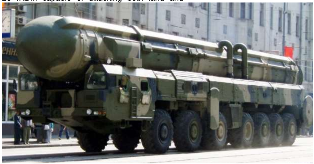
Figure 2: Chinese DF 41 Intercontinental Ballistic Missile. Source: (Bora 2017).

deployed nuclear-capable precision guided DF-26 IRBM capable of attacking both land and