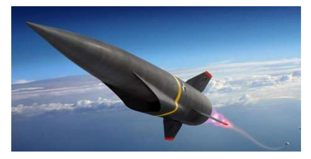
Figure 6: Russian Avangard hypersonic missile in flight.

These missiles include the U-71, Yu-74, BrahMos II and the 3m22 Zircon (Wang, 2016). Additionally, Russia has deployed Kh-47M2 Kinzhal, an operational air ballistic hypersonic missile capable of attaining a speed of Mach 10 and a range of 2,700 km (Mizokami, 2019a). Also, 3K22 Tsirkon (also known as Zircon), a sea and ground launched hypersonic missile with Mach 9 speed and an operational range of about 1,000 km was launched in 2012. In 2018, Russia developed its first and fastest ICBM launched hypersonic glide vehicle, Avangard which can deliver both nuclear and conventional payloads at a speed of Mach 27 (Novichkov 2019). Figure 6 shows a picture of the Russian Avangard hypersonic missile in flight. Other hypersonic missiles produced by the Russian Federation and their features are summarised in Table 1.