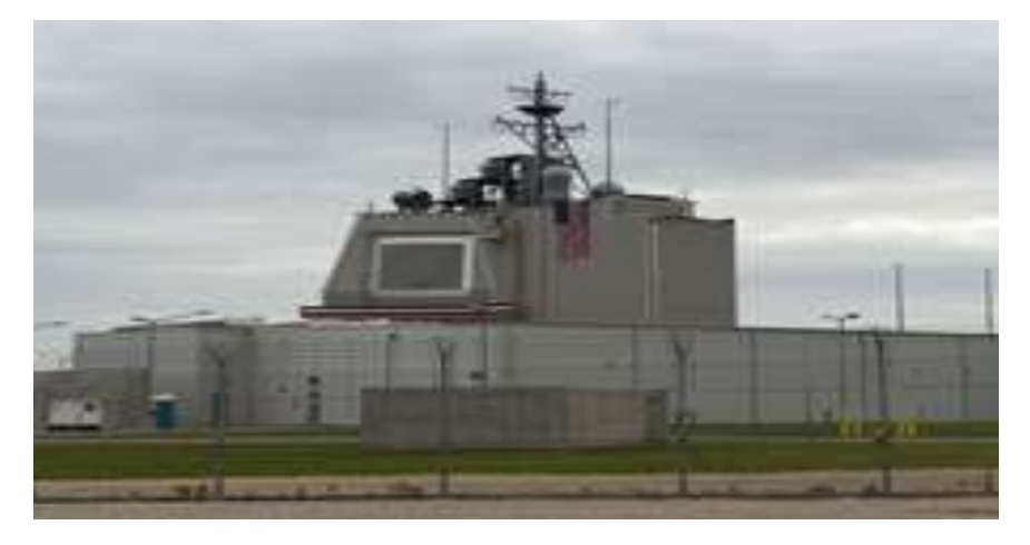
Figure 9: Aegis Ashore Ballistic Missile Defence System

The USA for the past 17 years has dedicated momentous efforts to developing and deploying a layered MDS (Department of Defence, 2019a). These efforts have led to the sustained development in the USA, allied, and partner missile defence performance and affordability. Presently, the USA had established a policy framework, a Missile Defence Review (MDR) that is reactive to new challenges and explore novel approaches to the defensive mission (ibid). The MDR implements a balanced and fused approach to opposing missile threats via a combination of deterrence, active and passive defences as well as attack operations. The current US MDS caters for mid-course and terminal flight missiles threats. Whilst SM-3, Ground Based interceptor and Aegis ships BMD systems are for mid-course flights, THAAD, PAC-3 and Sea-based Terminal are intended to neutralise enemy's missile on terminal flight (Defence Intelligence Agency 2019). In 2016, a latest version of the US MDS, Aegis Ashore shown in Figure 9 was launched (Williams 2018). The system incorporates a landbased versions of the various components used on Aegis ships. It is intended to serve as a midcourse defence against medium and short range missiles. Table 2 indicates the 21<sup>st</sup> Century's MDS of the USA and Russia. Based on the available information, the USA has deployed five MDS in the 21<sup>st</sup> Century as against four for Russia.