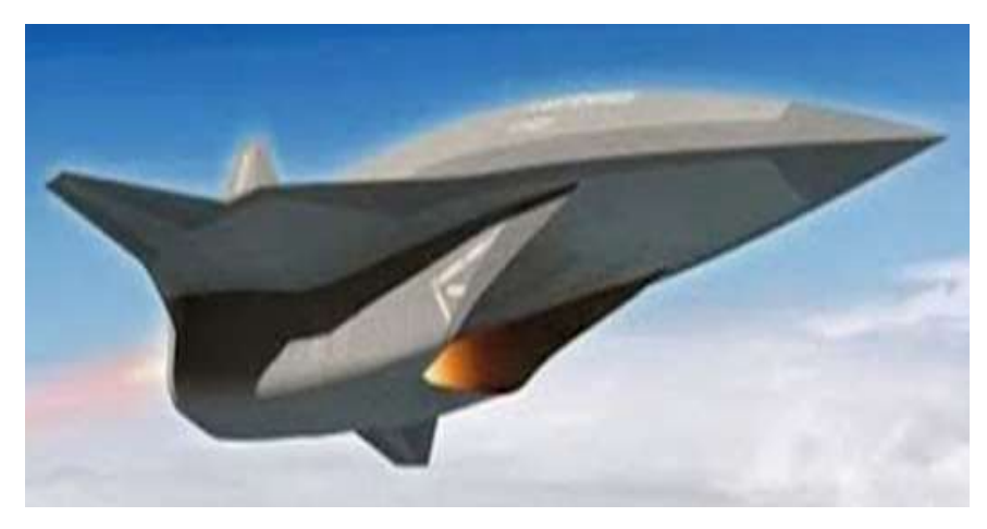
Figure 7: Chinese DF-ZF hypersonic missile.

Pettit 2017). The latter which is shown in Figure 7 is a short to mid-range hypersonic glide vehicle that would be able to fulfil a long term strategic goal by mitigating any potential threat emerging from an adversary carrier groups (Muspratt, 2018).