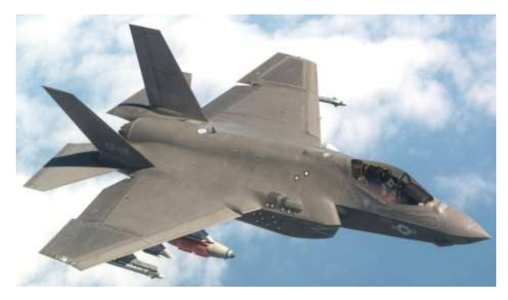
Figure 5: The USA's F-35A aircraft.

respectively (Department of Defence, 2018b). Figure 5 shows a picture of the F-35A aircraft used by the USA for strategic mission.