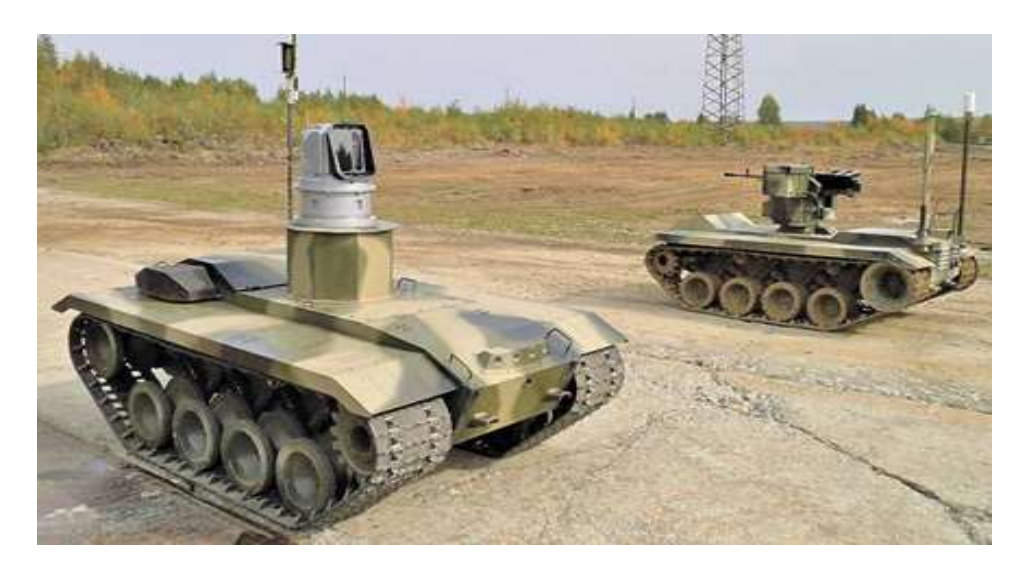
Figure 10: Russian Nerekhta Unmanned Ground Vehicle.

The second area is that of bio-convergence and advanced computing where human beings are network-connected via embedded and worn devices (Rosen, The Arms Race of the 21st Century is About AI, Automation, Beam Weapons, Space, and Force Fields 2018). engineering tools Genetic like Clustered Regularly Interspaced Short Palindromic Repeats (CRISPR) can be weaponised to produce better pathogens, synthetic biology or even transformed gut bacteria that could be conveyed by a chemical weapon to incapacitate human enemy force (Garthwaite 2016). Also, efforts are underway to improve brain implants connected to better reality, DNA-altering technologies in quest to producing a super-soldier, prosthetic limbs and development of exoskeletons to boost soldier's performance in combat (Rosen, The Arms Race of the 21st Century is About AI, Automation, Beam Weapons, Space, and Force Fields 2018). The use of the cyber-warfare is on the increase to ensure human-AI assets are able to combat any new threat whether on the battlefield or in domestic space. Acquiring a cyber-warfare capability is one of the newest must-have for many countries which has generated a cyberarms race that indicates no sign of slowing down Advanced countries (Mette 2018). are considering the option of cyber weapons along traditional weapons. Generally, cyber-warfare in the 21<sup>st</sup> Century is expected to accelerate, become a standard feature of warfare and stealthy cyber-war preparations will continue.