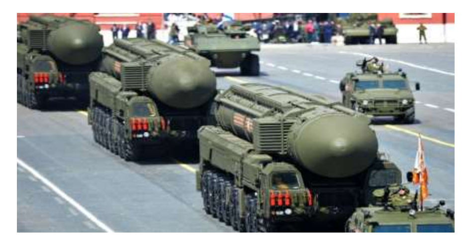
Figure 4: SSC-8 Ground Launched Cruise Missile.

attributed to the fact that these weapons are not accountable under the New START. Figure 4 shows an SSC-8 GLCM (9M729), one of the latest non-strategic nuclear weapons deployed in 2017.