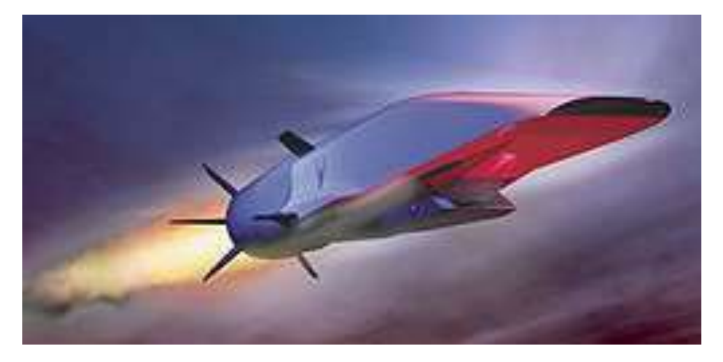
Figure 8: US Boeing X-51 hypersonic missile.

In order for the USA to bridge the existing gap with Russia and China with regards to missile technology, the Pentagon earmarked an average of over $2 billion per year from 2014 in developing hypersonic weapon systems for the US Army, Navy, and Air Force (Thompson 2019). The USA is currently developing a range of advanced hypersonic weapon systems ranging from hypersonic conventional strike weapon to air-launched rapid response weapon (Dolan, Gallagher and Mann 2019). Figure 8 shows a Boeing X-51 hypersonic missile being developed by the USA. Other hypersonic missiles undergoing development in the USA are listed in Table 1.