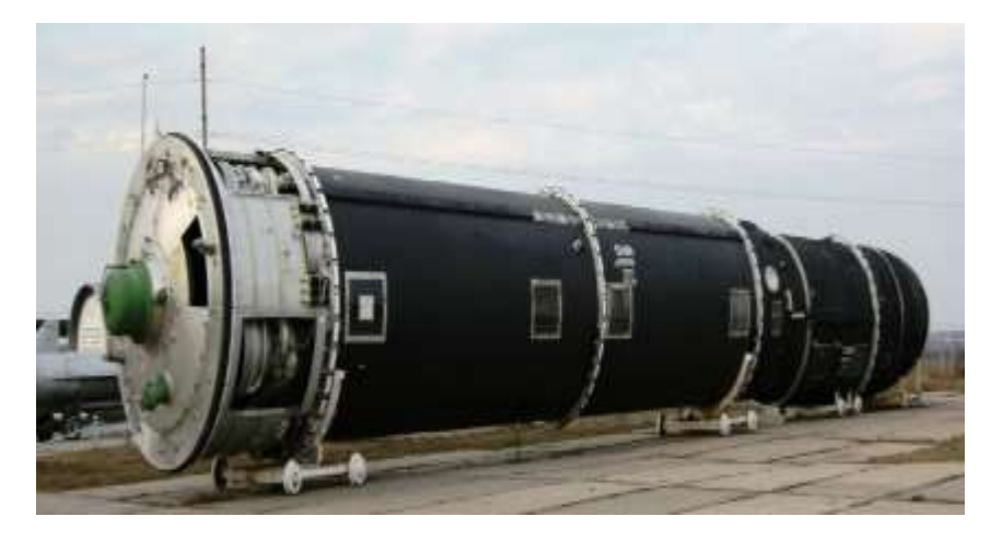
Figure 3: RS-28 Sarmat Intercontinental Ballistic Missile.

Additionally, Russia is simultaneously developing and deploying a huge, diverse and modern set of non-strategic systems that could be armed with either conventional or nuclear weapons (Kristensen and Norris 2012). The exploitation of these non-strategic weapons by Russia could be