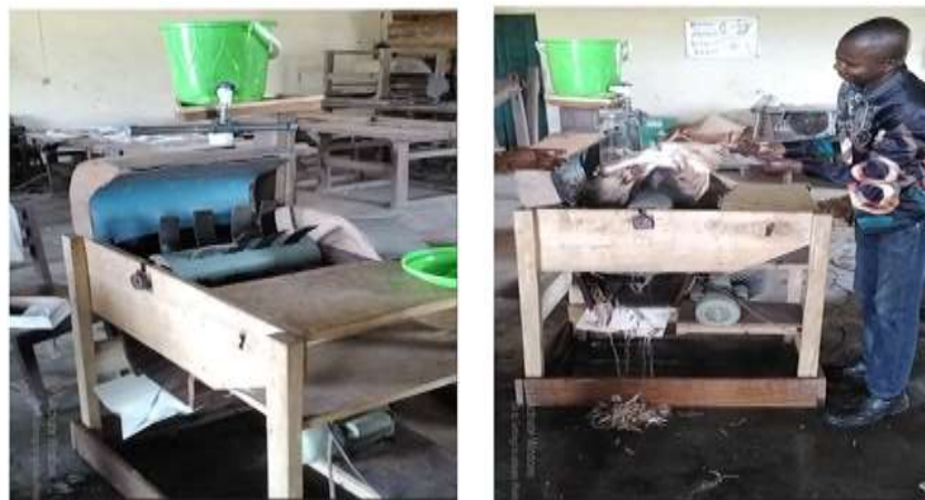
Figure 3. The developed machine under test

The feather chute was constructed of wood and lined with plastic to ensure non-sticking of feather to the wood during operation. A water irrigation system was incorporated to supply trickles of water from a dripping system into the fingers and the chamber to wash off feathers removed during operation.