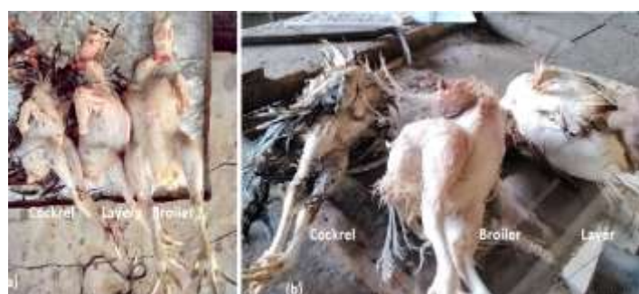
Figure 5. The defeathered birds (Canvas finger b) Rubber finger

about 80 degrees Celsius. It was equally observed that in attempt to force-feed the bird, the carcass secure noticeable tear and wounds around the breast and the limbs making them look unattractive. Defeathering efficiency: Figure 5 shows the sample products obtained using the canvas and rubber fingers in machine defeathering tests. Table 3 shows the mean defeathering efficiency of the machine compared with other locally fabricated machines. The efficiency of the machine is a function of time, temperature and the rate of feather removal. The machine recorded highest mean defeathering efficiency of 93.75 % at 80 °C scalding temperature at both 1 minutes for broiler, 85.71% at 1.25 minutes scalding time, and 65.22 % at 1.5 minute scalding time for local (cockerel) chicken respectively. This was slightly lower than machine efficiency of 95 % recorded by Adeyinka and Olawale (2015). The least defeathering efficiency of 65.22 % at 80 °C scalding temperature for both 1.5 minutes scalding time was recorded for local chickens may be attributed to the nature, age and skin toughness of the chicken.