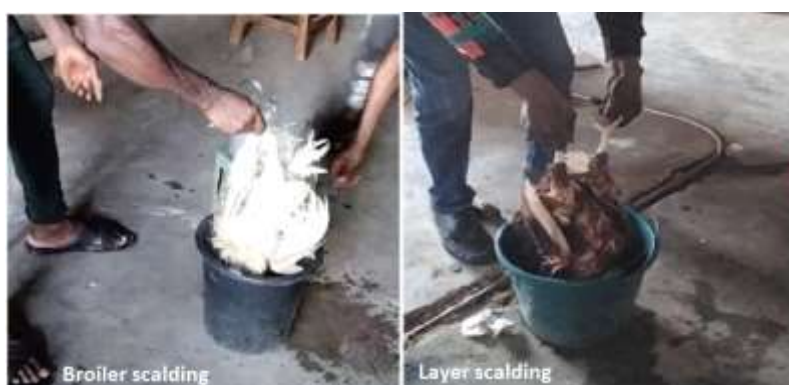
Fig 4. Scalding the bird in hot water

However, test carried out on local birds showed that the machine was less effective defeathering local chicken at low temperature, because of the toughness of the skin. From this result, it was evident that the scalding time, temperature and breed are dominant factors in defeathering operation.