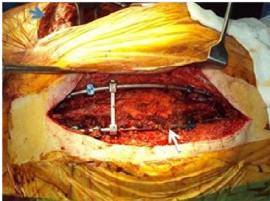
Figure 3: First posterior spinal fixation (white arrow) before the anterior thoracic time for hemi-vertebrectomy in a patient previously operated for CVH. Note the double approach, with posterolateral thoracotomy (blue arrow).

Associated neighbouring locations, were treated at the same time. Pulmonary or pleural cysts were treated at first, then the CVH. Treatment of the HC included two steps. The first one consisted in treatment of the parasite. After sterilization with hypertonic saline solution and suction of the cyst's content, the germinative membrane was removed. Treatment of the residual cavity was performed second. For the associated locations, it was conservative and consisted in pericystectomy. For the bone lesions, it was radical. One to 3 ribs were removed on average. Depending on the extent of vertebral involvement, corporectomy, either total or partial, was performed in 7 cases. Between 2 and 4 vertebrae were resected and spinal osteosynthesis was performed in 5 patients with bone grafts (figure 3).