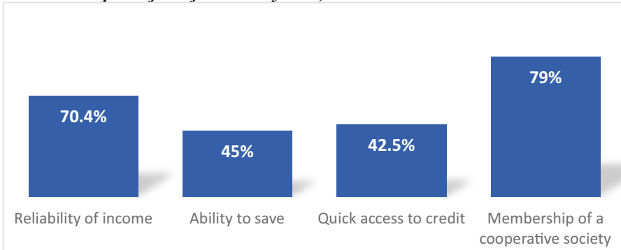
Fig. 4: Contributions of financial standard dimension to the deprivation of MT