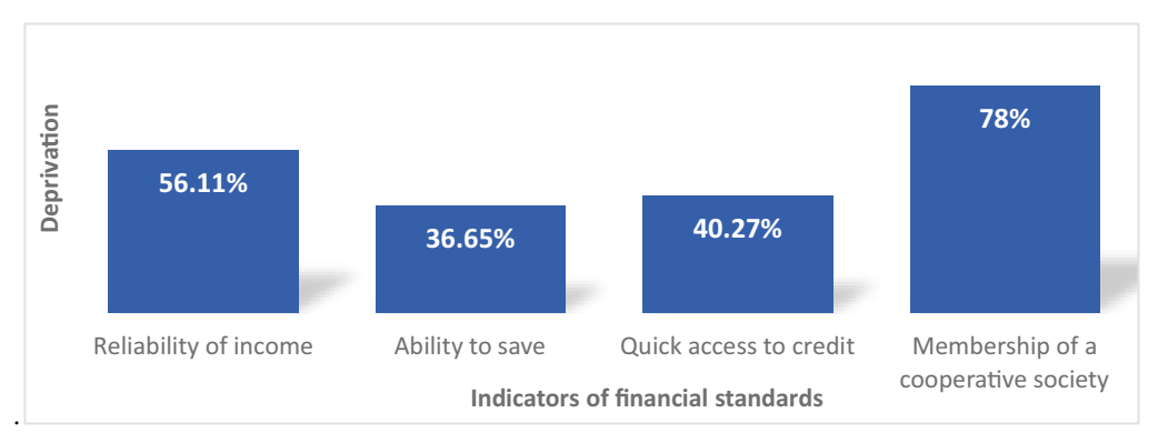
Fig. 3: Contributions of financial standard indicators to deprivation for MPT fisherfolks