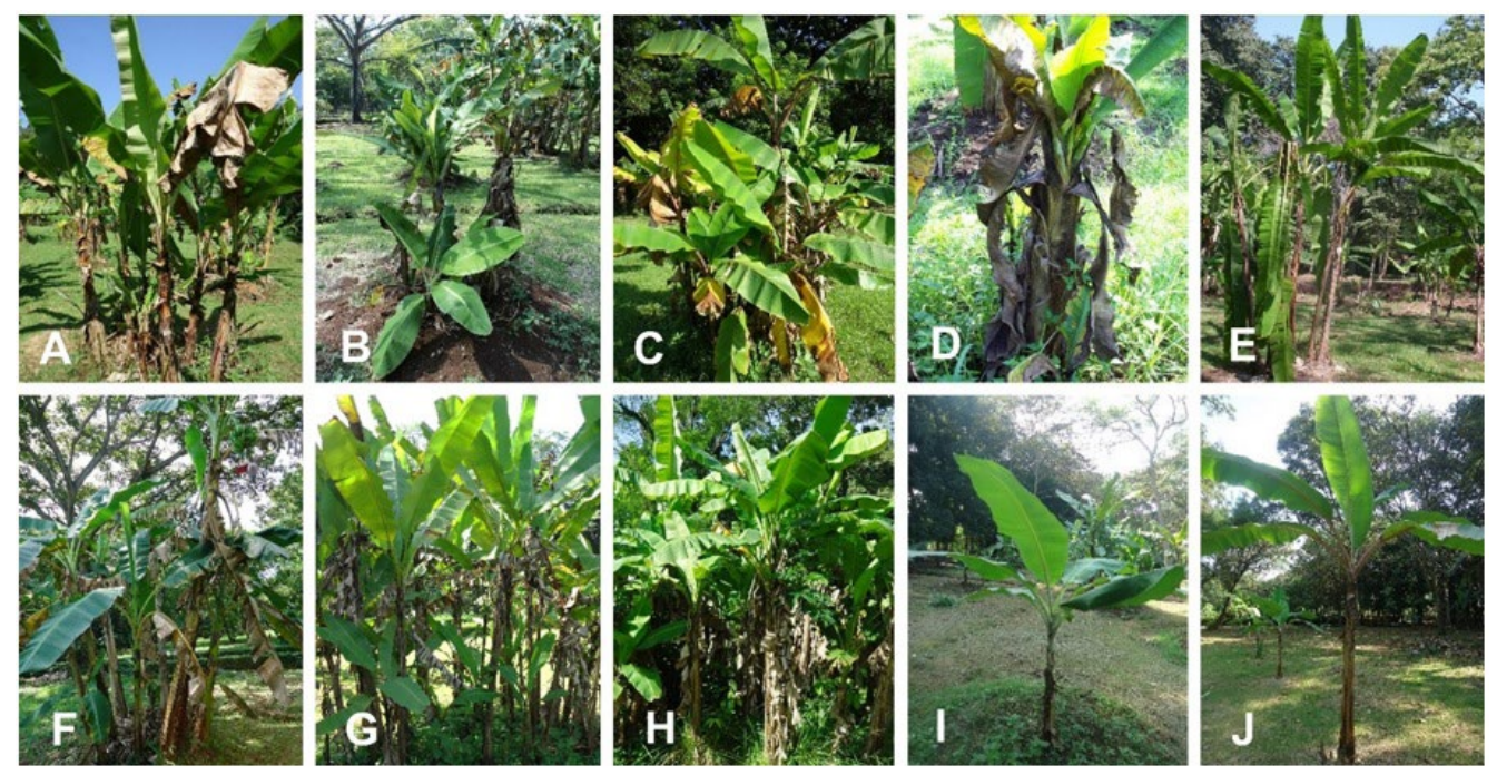
Figure 1. The BBTV symptoms of ten banana accessions: (A) Pisang Berlin, (B) Pisang Candi, (C) Pisang Billa, (D) Pisang Morosebo, (E) Pisang Mas Kripik, (F) Pisang Ebung, (G) M. acuminata var. rutilifes, (H) M. balbisiana/Klutuk Ijo, (I) Pisang Madu, and (J) Pisang Moseng

Unfortunately, the sequencing of nine isolates with full length amplicons (±1,000-1,100 bp) include Pisang Berlin, Billa, Morosebo, Mas Kripik, Ebung, Cici, Klutuk Ijo, Madu, and Moseng have resulted DNA sequences with very bad trace score ( \leq 15 ), low signal strength and very short contiguous read length ranged 0-34 nucleotides (nt). The total sequences length were varied 875 to 1120 (nt). The identity search of the sequences using NCBI BLASTn tools showed that some accessions were 9 to 66% homologued with M. acuminata or M. balbisiana genome DNA bacterial artificial chromosome (BAC) clone, instead of BBTV CP DNA-S sequences as the target. Therefore, those nine isolates were failed for further analysis. Meanwhile, sequencing of Pisang Candi amplicon has resulted DNA sequences in a total length of 484 nt, with high trace score (46) and signal strength. Further, the NCBI BLASTn homology search was showed similarity (99%) to the reported BBTV CP gene sequences from around the world isolates. Hence, only the BBTV sequences of Pisang Candi (to 450 nt medium contiguous read length) will be proceed for