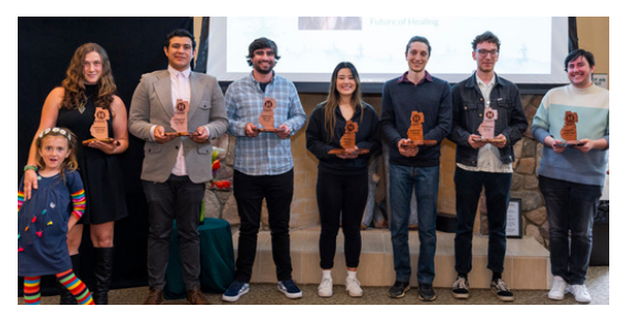
36th annual Student Research Competition participants from Cal Poly Humboldt

We are pleased to announce that the 37th annual <u>CSU Student Research Competition</u> is now open! The competition promotes excellence in undergraduate and graduate research and scholarly and creative activity, by recognizing outstanding student accomplishments throughout the 23 campuses of the California State University (CSU).