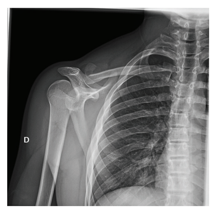
Fig. 1. Radiographic exam showing an unstable fracture of the distal clavicle.