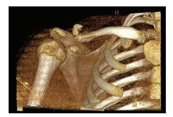
\begin{tabular}{ll} Fig.~2. Computed tomography scan. Three-dimensional reconstruction. \end{tabular}

exam, and the patient reached a pain-free range of motion.