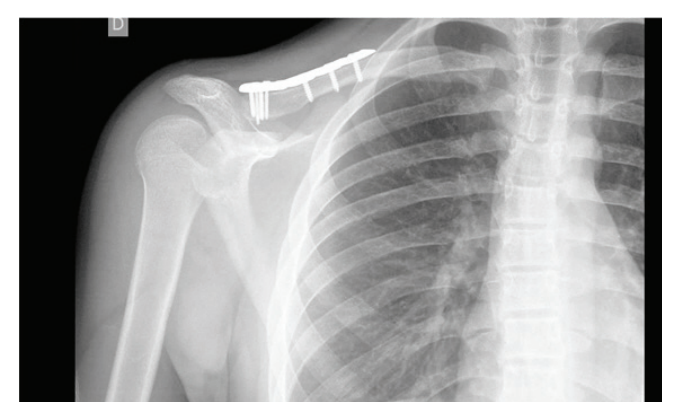
Fig. 5. Postoperative radiographic exam.

scribed by Rockwood [5], added two subtypes to describe five types of fractures of the distal clavicle. Type I fracture occurs lateral to the coracoclavicular ligaments attachment with minimal