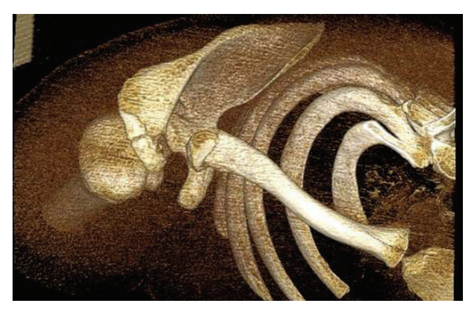
Fig. 4. Computed tomography scan. Three-dimensional reconstruction showing minimal posterior displacement.