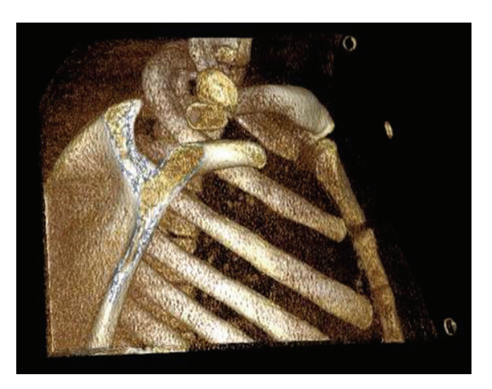
\begin{tabular}{ll} Fig. \ 3. \ Computed \ tomography \ scan. \ Three-dimensional \ reconstruction. \end{tabular}

Many authors have proposed classification systems for clavicle fractures. Allman [2] classified clavicle fractures into three types based on anatomical location without considering treatment or prognostic significance. Nordqvist and Petersson [3] broadened Allman's classification according to degree of displacement. Robinson [4] classified clavicle fractures base on joint involvement. The most accepted classification, described by Neer [1] and de-