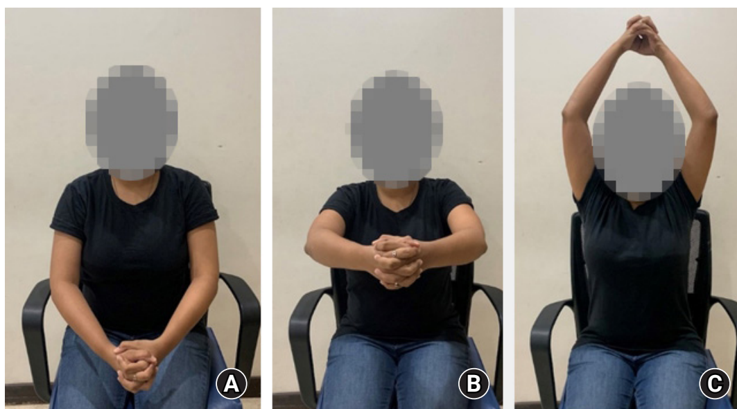
Fig. 1. Self-assisted elevation exercises with the patient sitting on a chair. (A) He/she interlocks their fingers and their elbows are flexed at 20°–30°, at rest the arms are internally rotated. (B) He/she slowly elevates both arms together in a controlled fashion. (C) He/she then fully elevates their arms together on top of the head, and in doing so the arms get externally rotated.

were asked to sit on a chair at a distance of 6 feet from the mobile phone or laptop device; a phone had to be held by a family member who adjusted its position to center the patient image. The patients were taught the following exercises and were asked to repeat them 10 times. All four exercises were taught sequentially. Patient compliance to the exercise regimen was ensured by supervising them via the virtual platform once every month by the