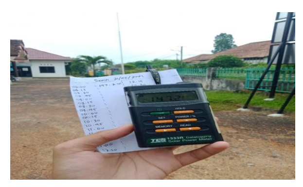
Figure 1. Solar irradiance measurement