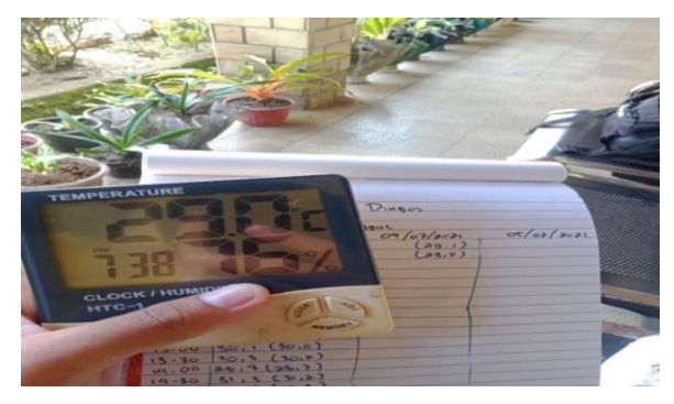
Figure 2. Ambient temperature measurement