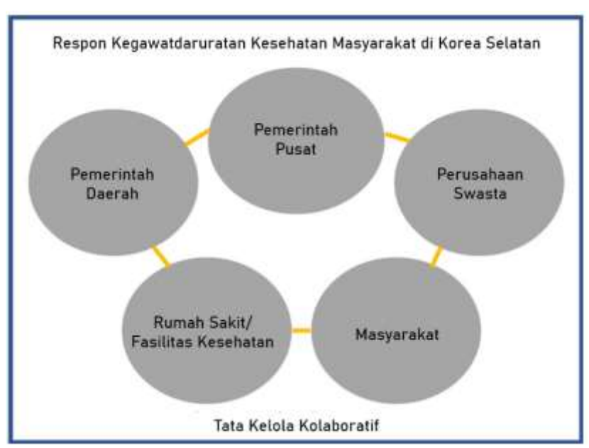
Figure 2. Collaborative Governance in Handling COVID-19 in South Korea adapted from Choi (2020)

South Korea—as well as China, Taiwan, and a number of other East Asian countries—had experience with SARS outbreaks in 2002 and H1N1 in 2009. In both outbreaks, poor conditions were mainly due to incompetent governments. In some countries, this is exacerbated by the lack of transparency and very few diagnostic tools for conducting tests. This then did not happen in South Korea. Based on experience in dealing with outbreaks, the public administration has also experienced adjustments and adaptations to support the acceleration of handling COVID-19. The Korea Centers for Disease Control and Prevention (KCDC) are at the forefront of handling this outbreak and are given space to access GPS information, financial data, and cellular activity data for tracing purposes. This is not the case in many countries due to privacy settings, lack of devices, lack of staff capable of performing these activities, and the like. Cellphone Tracking is also by CECC in Taiwan which allows early detection, including self-quarantine arrangements. So that things like people who are exposed to SARS-CoV-2 but have no symptoms can be active in the community and make it possible to transmit the virus to people who are more vulnerable, can be reduced.