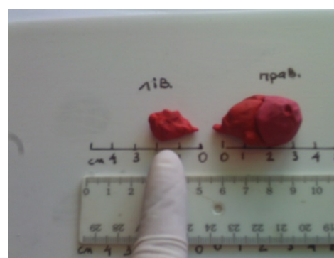
Fig. 1. Methods of morphometry in vivo of palpation diagnostics data using life-size volumetric ovarian models

under the influence of the normalization of metabolic processes, including hormonal processes in the body (Roman et al., 2020).