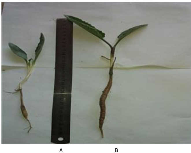
Fig. 1. Two-year-old F. foetida (A) and F. tadshikorum (B) plants.

The leaves of both species were morphologically different. The leaf blade of F. tadshikorum was rhombic, while that of F. foetida was ovate. In both species, the second leaves appeared 10-15 days after the first leaf, but the second leaf was longer and wider than the first. The leaf segments of F. tadshikorum are large and bright green. Second-year individuals of F. foetida are characterized by the presence of trichomes under the leaves, while F. tadshikorum – barely noticeable. In addition, in juvenile plants of F. tadshikorum , the leaf petiole differs from F. foetida in ink color. The size and number of leaves for both species are given in Table 2.