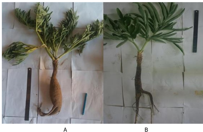
Fig. 5. Six-year-old F. foetida (A) and F. tadshikorum (B) plants.

the amount of precipitation and temperature were both lower than in an average year. In spring, high temperatures caused the leaves of both species to start yellowing and transition quickly to a dormant state. In plantation areas, F. tadshikorum and F. foetida mostly produced 2-3 leaves, and only rarely produced a 4th leaf. The leaf blades of F. tadshikorum were long, large, each leaf doubly pinnately dissected at a young age, the leaf lobes 10-15 cm long and 5-8 cm wide, while the leaves of F. foetida were doubly pinnately dissected at this stage, 5-12 cm long and 3-6 cm wide. The leaf blades of F. foetida were more divided than in F. tadshikorum and also differed in height and width. From the second to the sixth year, tuberous thickening was observed in F. foetida and F. tadshikorum roots, the length of which increased year by year. The morphological features of the roots of both species began to differ from each other. The morphological characteristics of the roots of both species are given in Table 3.