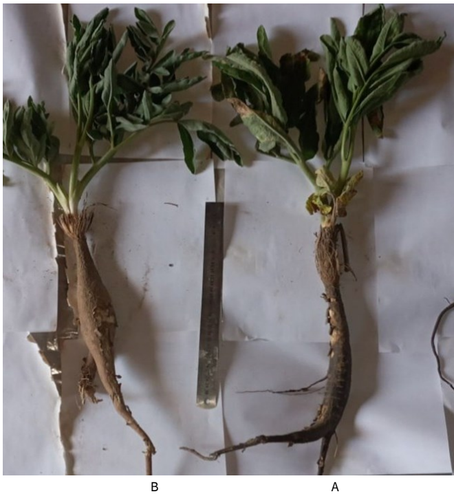
Fig. 4. Five-year-old F. foetida (B) and F. tadshikorum (A) plants.