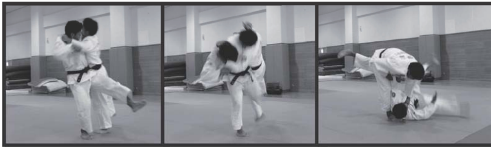
Figure 1: Breakfall for osoto-gari:

The difficulty of the breakfall and the perceived risk of injury may lead to a judoka perceiving fear of being injured, which may be detrimental to learning the breakfall skill. However, the association between perceived fear and breakfall kinematics has not been adequately studied. Therefore, the aim of this study was to investigate this association in novice judokas.