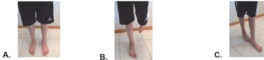
Figure 1. A. Double leg stance; B. Single leg stance; and C. Tandem stance performed during BESS protocol and exercise program.

assess cognitive function following concussion in both research and clinical settings. For this study the ImpACT assessed verbal memory, visual memory, reaction time, and visual motor speed of the participants. Lastly, participants performed the Balance Error Scoring System (BESS) protocol on an AMTI force platform. Participants stood in a double leg stance position with the feet touching (side by side), hands on his/her iliac crests with their eyes closed; single leg stance position standing on the non-dominant leg with hands on his/her iliac crests and their eyes closed; and tandem stance position standing with the toes of the non-dominant foot touching the heel of the dominant foot, hands on his/her iliac crests, and their eyes closed (Figure 1).