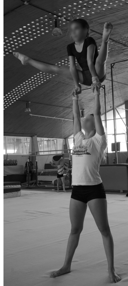
Figure 1: Straddle lever pyramid.

straddle position. During the performance of the pyramids, the base gymnast stood with one foot on each platform to facilitate recording of the variations in the centre of pressure at a frequency of 200 Hz. Five successful trials were recorded for each pair, with at least 2-3 minutes rest allowed between trials.