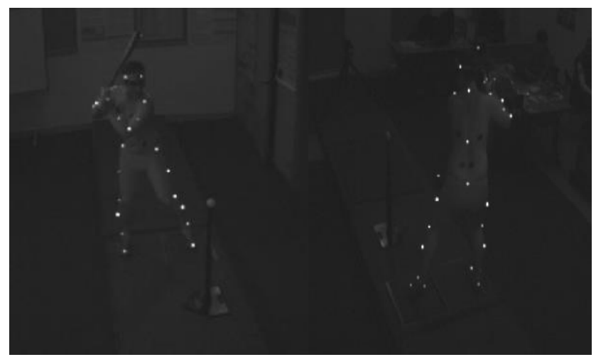
Figure 1: Baseball hitting motion.

METHODS: Three subjects (age = 25.8 \pm 2.6 years, height = 176 \pm 2.5 cm, mass = 72.4 \pm 5.3 kg) participated in this study. Subjects were right-handed hitters who playing local baseball league and completed 5 times of the baseball hitting task using the T-ball (Figure 1).