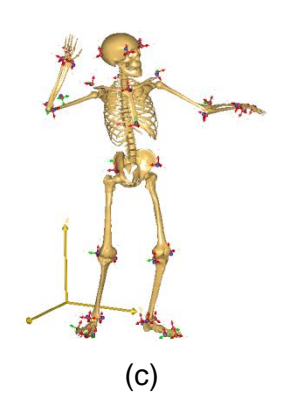
Figure 2: Full body model and marker placements during the throwing the pilot trial. (a) – Experimental setup for Motion capture; (b) – Our model; (c) – AnyBody<sup>TM</sup> model.

RESULTS AND DISCUSSION: Table 1 summarizes the limb lengths \hat{l}^* obtained with our calibration (Figure 2(b)) and the ones obtained in AnyBody<sup>TM</sup> (Figure 2(c)) for all trials. The lengths of the distal members were not compared due to their dependency to the associated markers location. Markers placement comparison seemed difficult to achieve since their local coordinates were not expressed in the same way for both models.