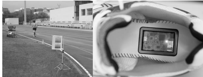
Figure 1: Runner during a constant-speed test (left) and IMU integrated in the midsole (right).

The foot motion at the sagittal plane was recorded by using an inertial measurement unit (IMU) integrated in the midsole of the running shoe (Figure 1). The angle of foot motion was calculated using the algorithm described by Favre et al., (2006). The sensor was validated by the procedure described by Parrilla et al., (2013), obtaining +/-0,7° error.